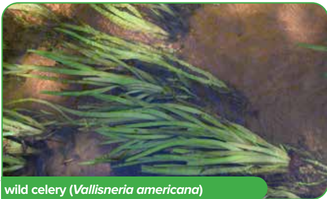
wild celery ( Vallisneria americana )