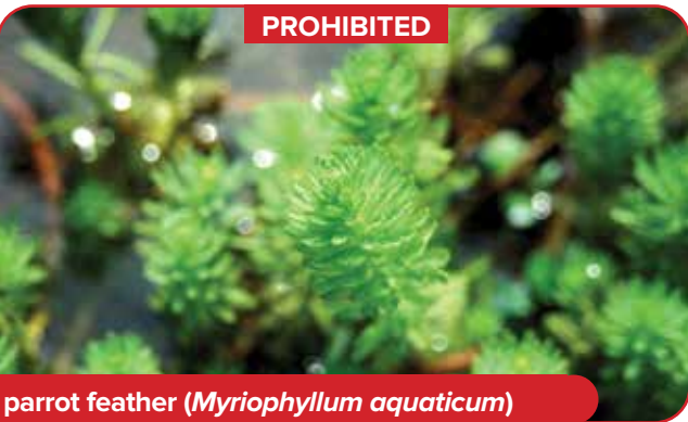
parrot feather ( Myriophyllum aquaticum )