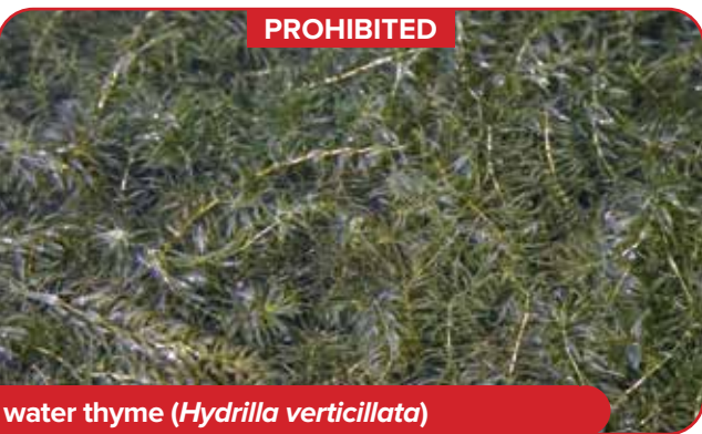
water thyme ( Hydrilla verticillata )