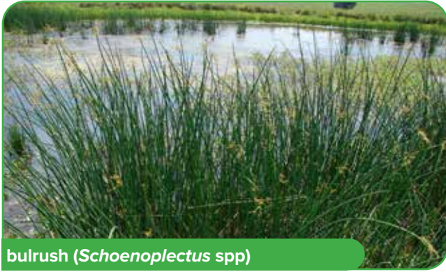
bulrush ( Schoenoplectus spp)