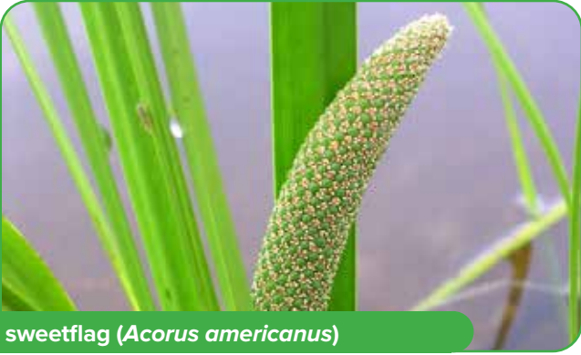
sweetflag ( Acorus americanus )