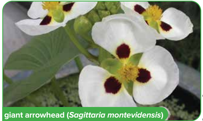
giant arrowhead ( Sagittaria montevidensis )