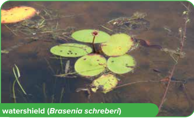
watershield ( Brasenia schreberi )