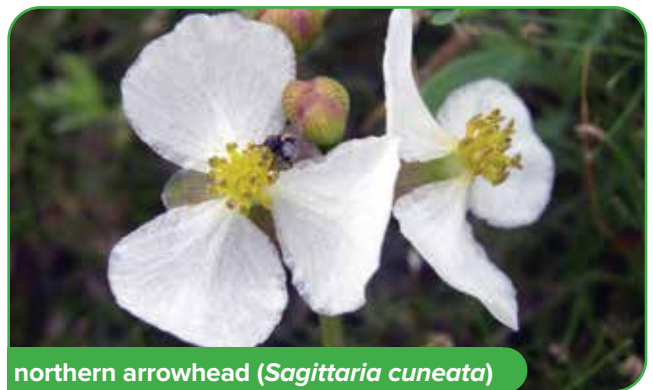
northern arrowhead ( Sagittaria cuneata )