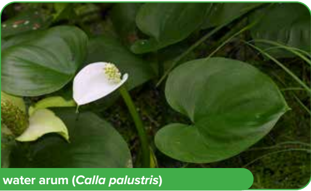
water arum ( Calla palustris )