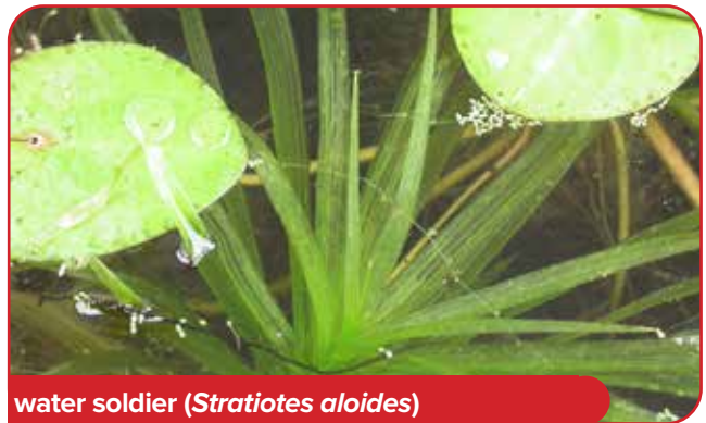
water soldier ( Stratiotes aloides )