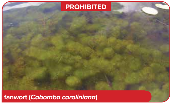
fanwort ( Cabomba caroliniana )