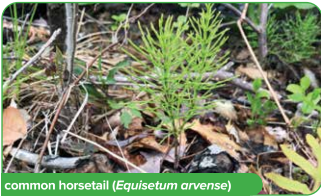
common horsetail ( Equisetum arvense )