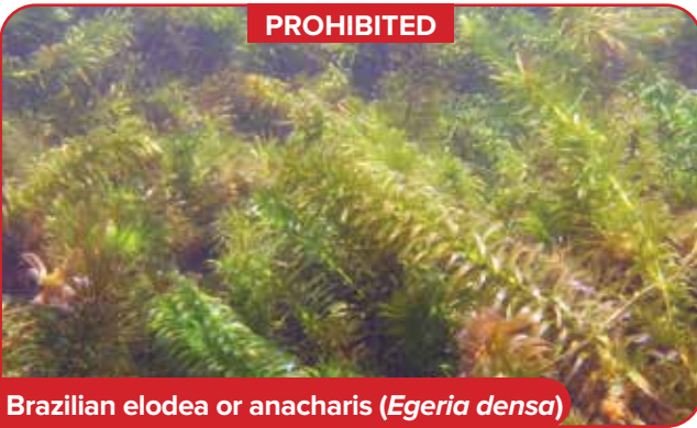
Brazilian elodea or anacharis ( Egeria densa )