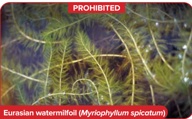
Eurasian watermilfoil ( Myriophyllum spicatum )