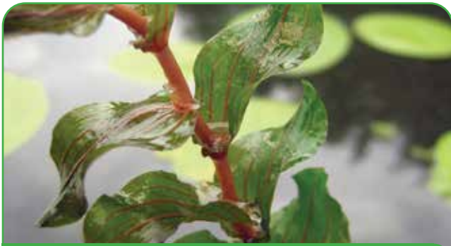
clasp-leaved pondweed ( Potamogeton perfoliatus )