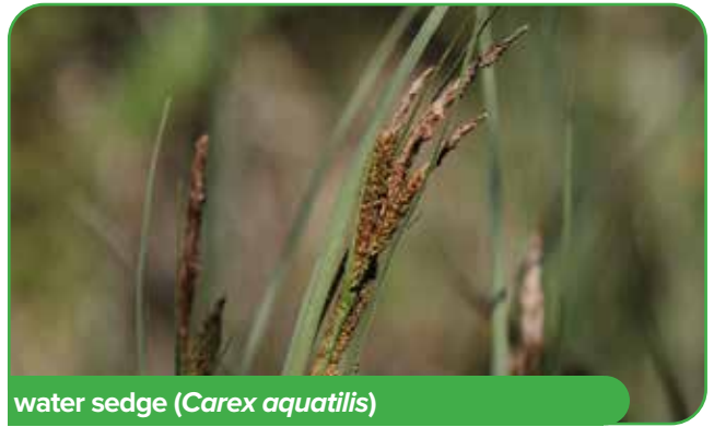
water sedge ( Carex aquatilis )