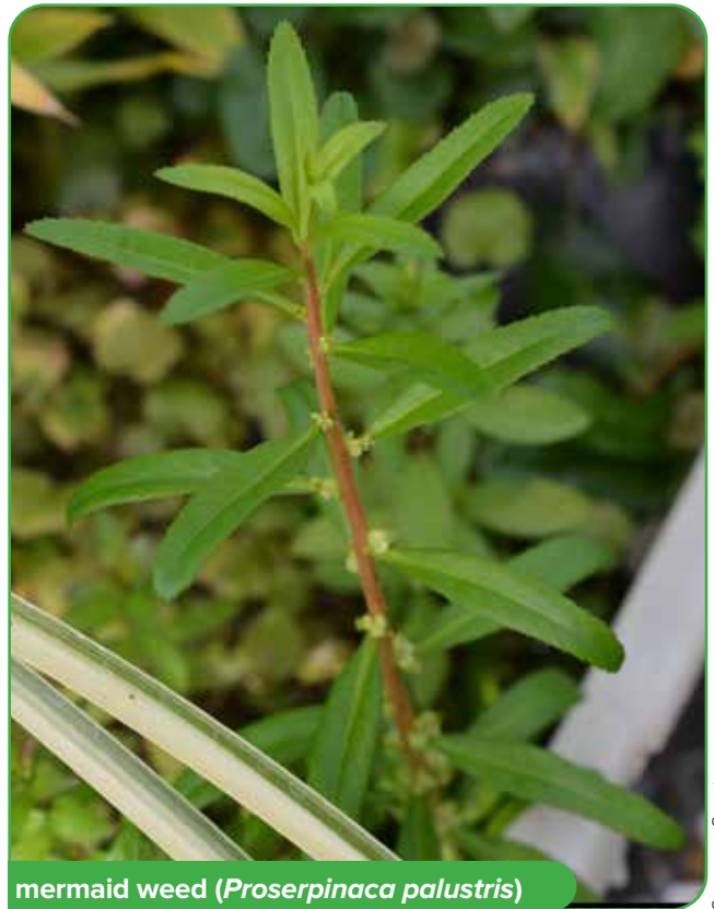
mermaid weed ( Proserpinaca palustris )