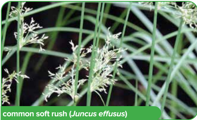
common soft rush ( Juncus effusus )