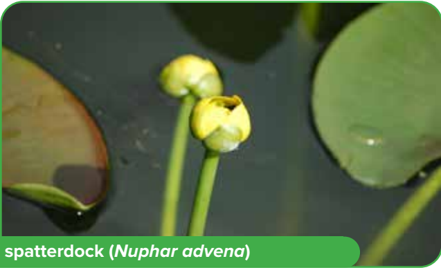
spatterdock ( Nuphar advena )