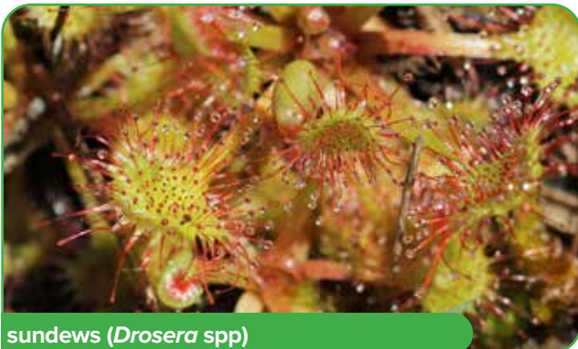
sundews ( Drosera spp)

Carnivorous plant found in peat bogs that are low in essential nutrients such as nitrogen, calcium, magnesium, and potassium. They photosynthesize but also capture small insects in their water-filled pitcher-shaped leaves and digest them with enzymes. Plants grow 8–12 inches high. Leaves vary in color from reddish-green to purple and red and grow up to 8 inches long. Leaves congregate around a single nodding flower with bright red, rounded petals. Herbaceous perennial.