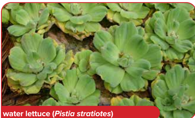
water lettuce ( Pistia stratiotes )