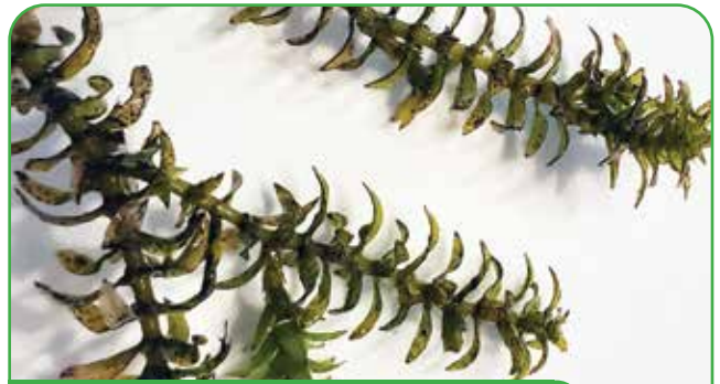
common waterweed ( Elodea canadensis )