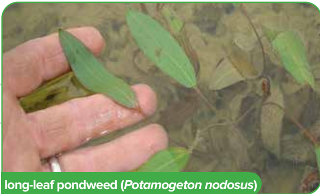
long-leaf pondweed ( Potamogeton nodosus )