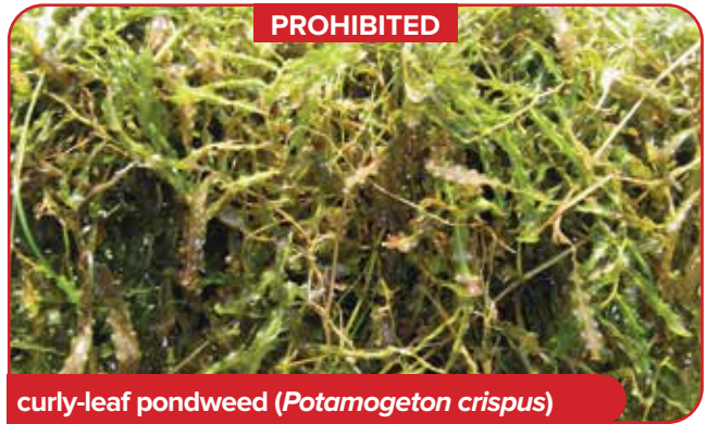
curly-leaf pondweed ( Potamogeton crispus )