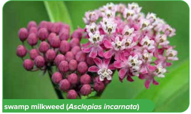
swamp milkweed ( Asclepias incarnata )