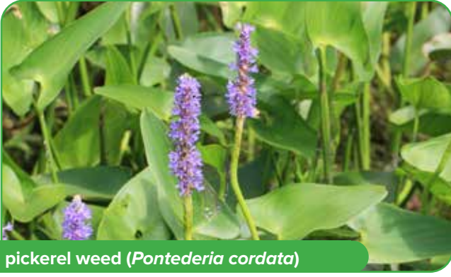
pickerel weed ( Pontederia cordata )