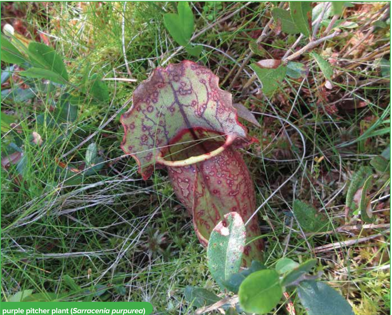
purple pitcher plant ( Sarracenia purpurea )

Carnivorous plant found in peat bogs that are low in essential nutrients such as nitrogen, calcium, magnesium, and potassium. They photosynthesize but also capture small insects in their water-filled pitcher-shaped leaves and digest them with enzymes. Plants grow 8–12 inches high. Leaves vary in color from reddish-green to purple and red and grow up to 8 inches long. Leaves congregate around a single nodding flower with bright red, rounded petals. Herbaceous perennial.