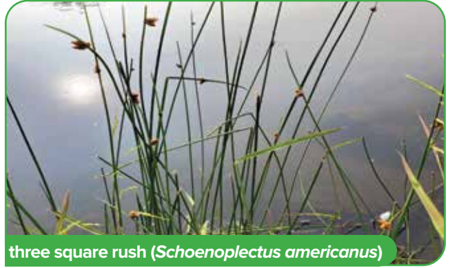
three square rush ( Schoenoplectus americanus )