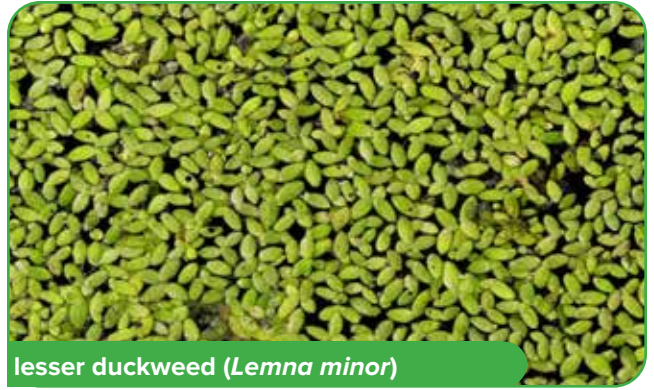
lesser duckweed ( Lemna minor )