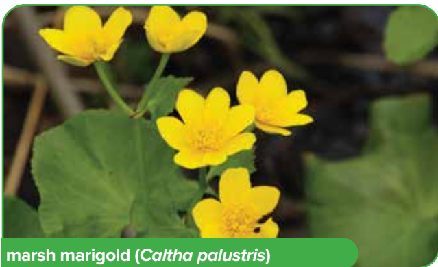
marsh marigold ( Caltha palustris )