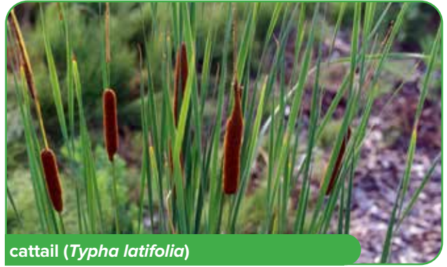
cattail ( Typha latifolia )