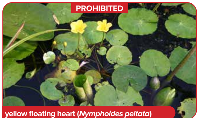
yellow floating heart ( Nymphoides peltata )