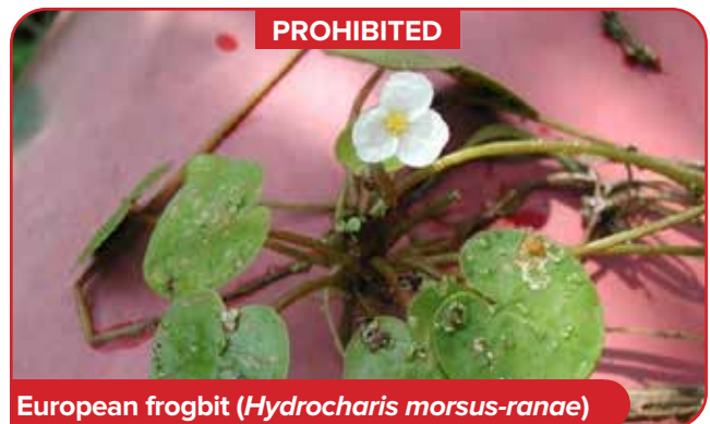
European frogbit ( Hydrocharis morsus-ranae )