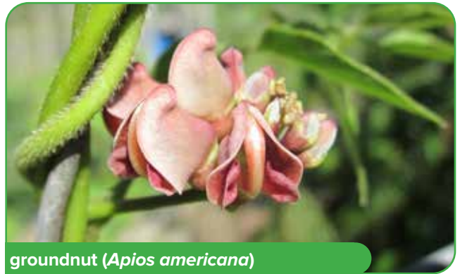
groundnut ( Apios americana )