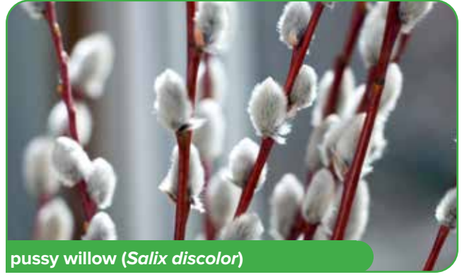
pussy willow ( Salix discolor )