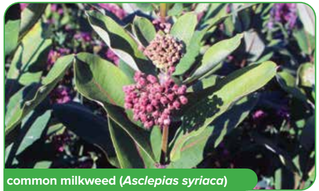
common milkweed ( Asclepias syriaca )