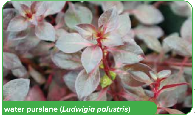
water purslane ( Ludwigia palustris )