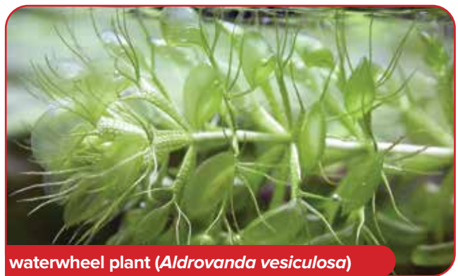
waterwheel plant ( Aldrovanda vesiculosa )