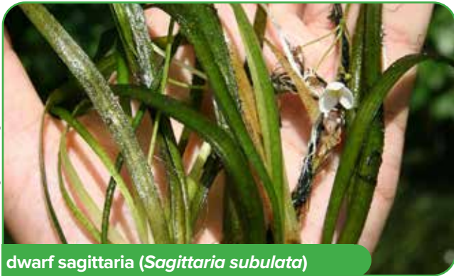
dwarf sagittaria ( Sagittaria subulata )