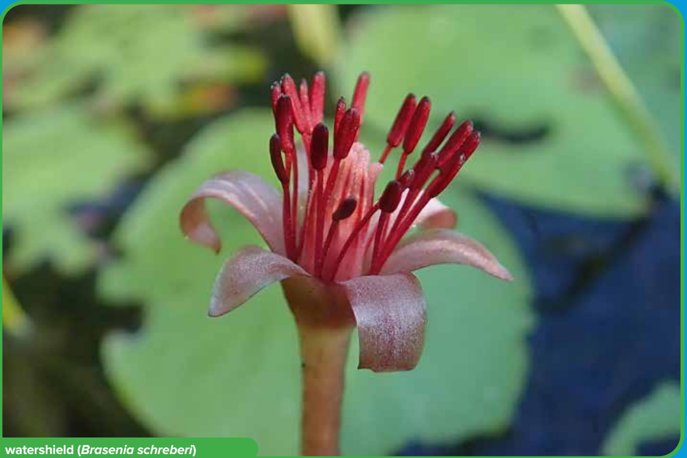
watershield ( Brasenia schreberi )