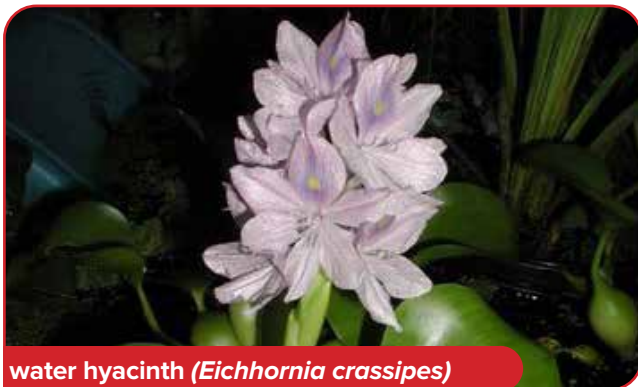
water hyacinth ( Eichhornia crassipes )