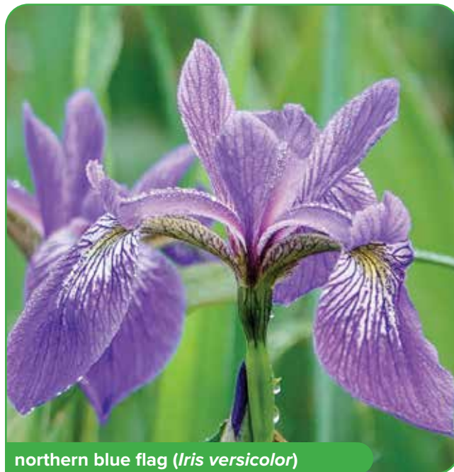
northern blue flag ( Iris versicolor )

Grows 2–6 inches tall. Leaves are alternate and toothed. Flowers are fire-engine red and tubular in shape, growing 1–1.75 inches in length. Requires saturated to wet-mesic soils. Comparatively easy to grow. Hummingbirds are attracted to the nectar. Herbaceous perennial.