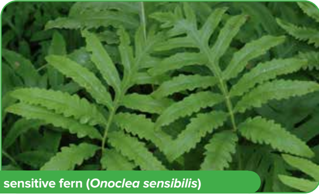
sensitive fern ( Onoclea sensibilis )