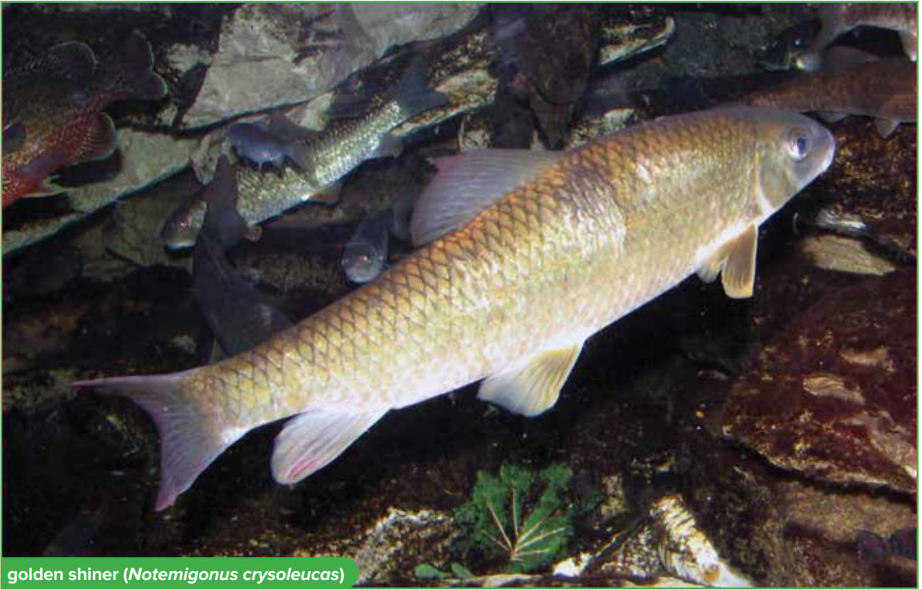
golden shiner ( Notemigonus crysoleucas )

Habitat-generalist fish, one of the most widespread in NYS. Juveniles are silver in color, but adults are gold or brassy with red fins. Adults are typically 5–7 inches long, but can grow as long as 10 inches. Reach maturity at age two. Spawn in late spring/early summer, eggs adhere to submerged vegetation. Habitat ranges from quiet ponds with submerged aquatic vegetation to large rivers. Popular bait fish.