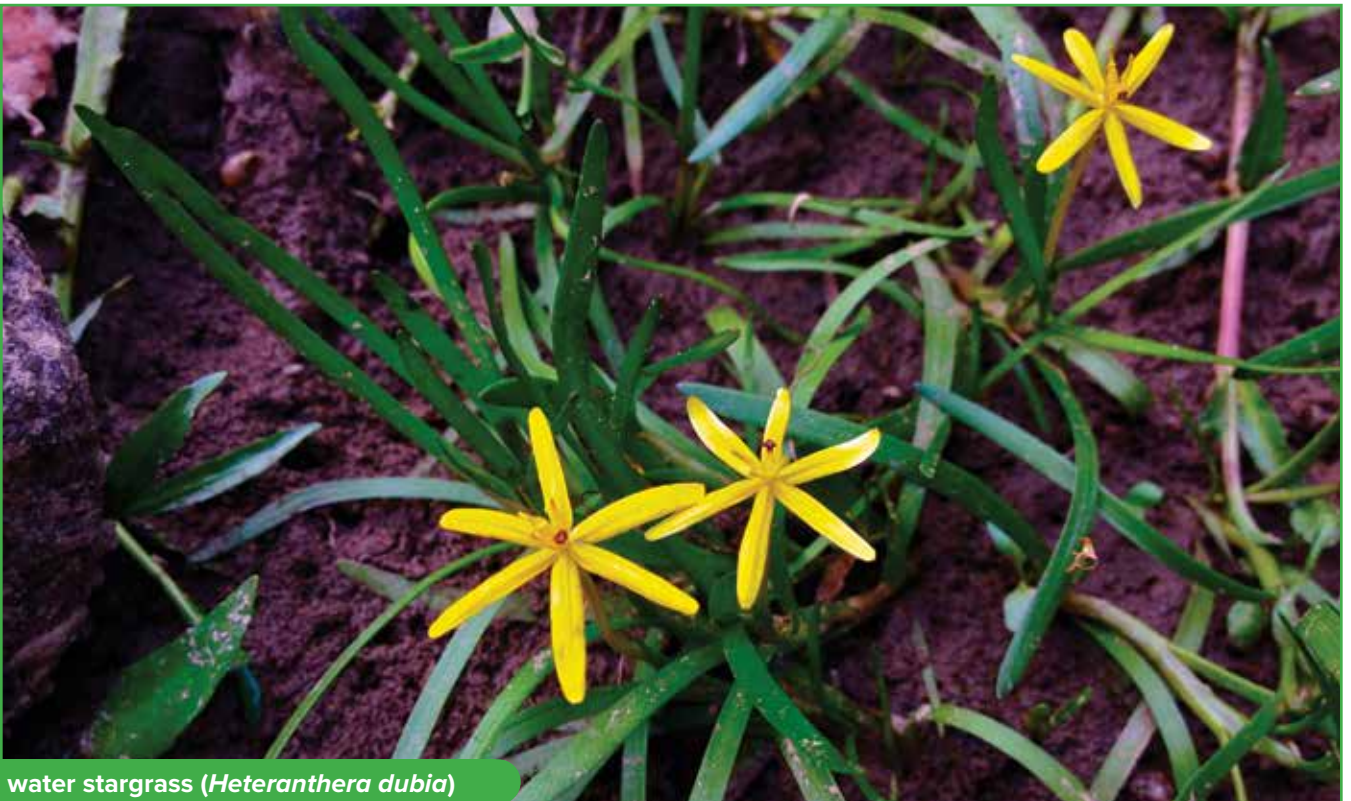
water stargrass ( Heteranthera dubia )

Thin, grass-like branching stems. Can grow up to 6 feet long and form floating colonies. Bright yellow, star-shaped flowers appear in late summer. Valuable habitat for microinvertebrates. Perennial.